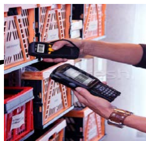
FILE STACKING AND QR CODING