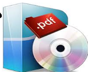
UPLOADING DATA TO DMS