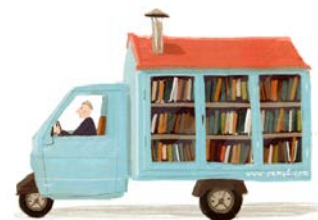
PICK UP FROM CLIENT